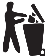
Using recycling bins